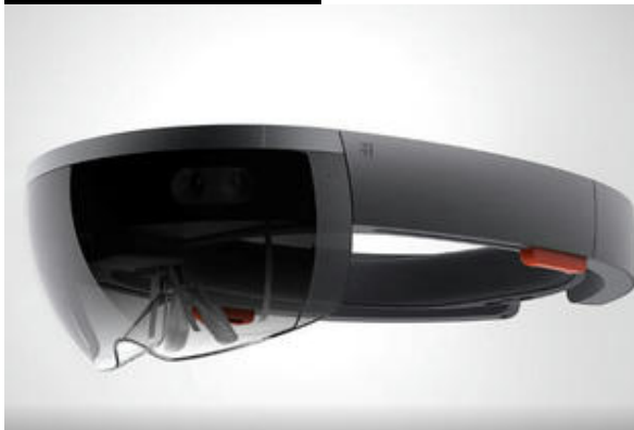
From www.ejinsight.com - Aujourd'hui, 09:22