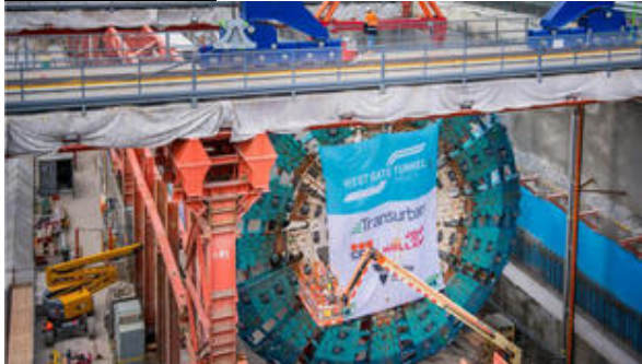
From www.tunnelsonline.info - 7 mars, 09:14