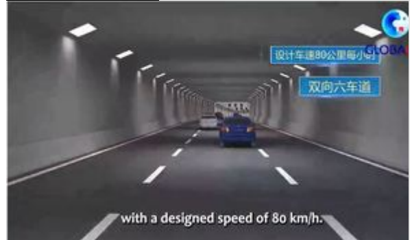
Aujourd'hui, 10:51