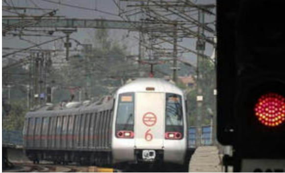
From www.hindustantimes.com - Aujourd'hui, 09:17

The upcoming Silver Line, connecting Tughlakabad to Aerocity as part of Delhi Metro's Phase 4 expansion, will pass under 17 pairs of active railway tracks for which the Delhi Metro Rail Corporation (DMRC) has already sought permissions from the Indian Railways, officials said.