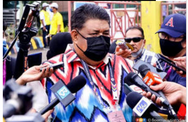
From www.freemalaysiatoday.com - Aujourd'hui, 10:18

The Melaka state government is considering plans for an undersea railway tunnel across the Straits of