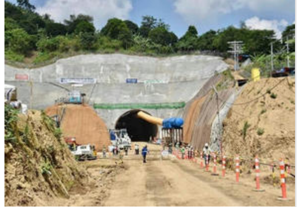
From philkotse.com - Aujourd'hui, 10:22

The Department of Public Works and Highways (DPWH) announced that it is hastening the construction of the 45.5-km Davao City Bypass Tunnel project in Davao City.