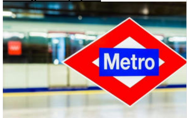
From www.intelligenttransport.com - Aujourd'hui, 10:29

Metro de Madrid will allocate more than €18 million to modernise access