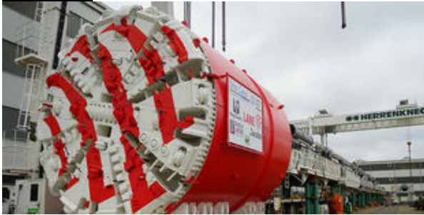
From www.khl.com - Aujourd'hui, 09:28

Seattle is midway through a US$570m wastewater tunnelling project involving the creation of a 2.7 mile long underground storage tunnel using a 6.6m diameter TBM