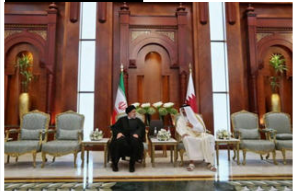
From www.asianews.it - Aujourd'hui, 11:03

The project would link the Iranian port of Bandar-e Deyr to an unspecified location in Qatar. The underwater tunnel would run for 190 km, with both road and railway sections, although the former is more difficult. President Raisi is in Doha to sign four cooperation agreements, from energy to transport.