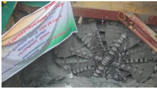
From indianexpress.com - 12 novembre, 08:26

Varada, launched in March this year at the Rashtriya Military School station in Vellara, reached Langford Town station Thursday after completing tunnelling works through a length of 594 metres.