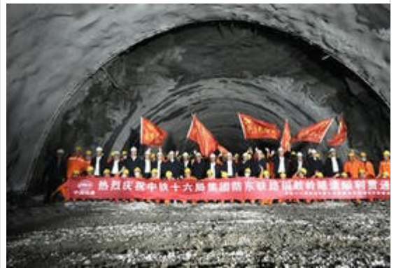
From www.globaltimes.cn - Aujourd'hui, 11:23